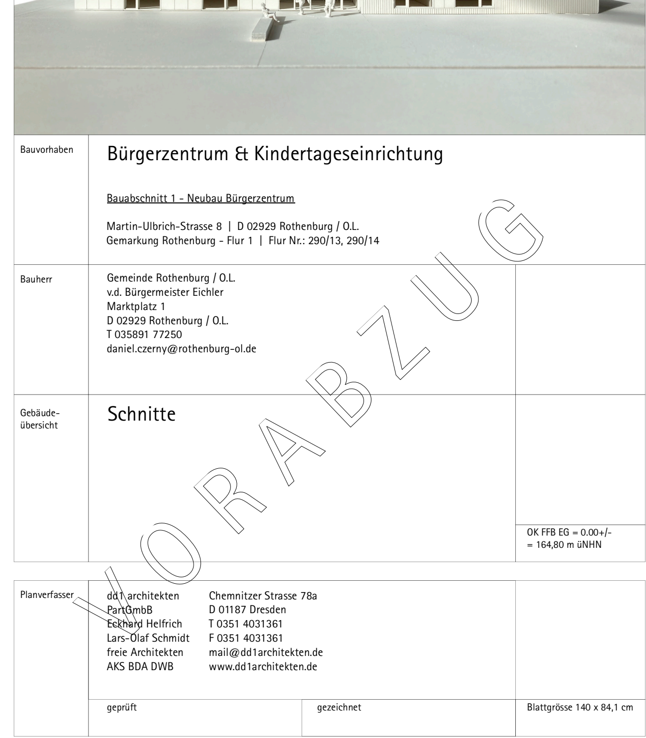
geprüft gezeichnet Blattgröße 140 x 114,1 cm